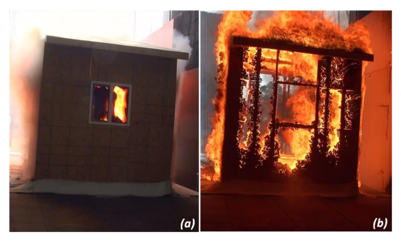
Figure 6. An example of real structures tested used in similar studies (a) after 4 minutes (b) the same structure after 10 minutes