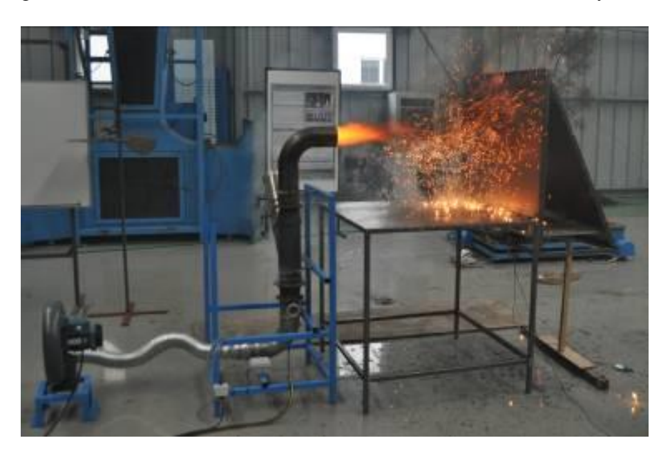
Figure 1. Firebrand Generator Device

Studies on ember aerodynamic transport and on new ignitions inside houses caused by embers transposing gaps are being developed. In order to carry out this study program a firebrand generator similar to the Dragon developed at NIST by (Suzuki and Manzello, 2011) was built at CEIF by Freitas (Fig.1). The original device was used in Manzello et al. (2013) for a similar study.