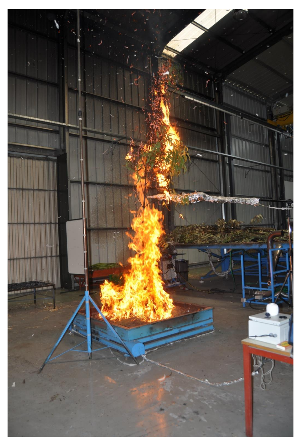
Figure 5. An example of firebrand generated by the burning of trees

Particles position inside the structure can be studied as a limit parameter of an Inside Home Ignition Zone (IHIZ), the inside home fuels (curtains, armchairs, carpets) that an ember could find next to an opening like a window or a door and burn them.