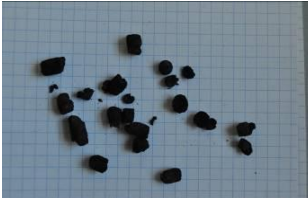
Figure 4. An example of firebrand dimensions obtained in the tests are showed in a 3 mm x 3 mm grid

It is expected to extend the analysis for other particle sizes different of the ones represented in figure 4.