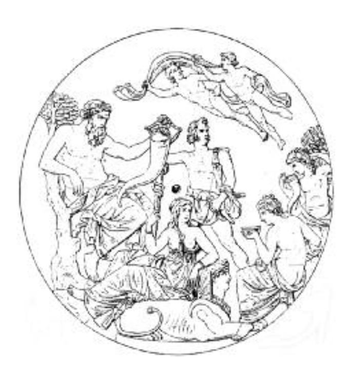
Fig. 7: Drawing of the interior scene of the Tazza Farnese, after Fürtwängler 1900: II, 256. Downloaded August 2011 from <http://digit.ub.uni-heidelberg.de>.

One last masterpiece which sheds light on other universal horizons of Alexandrian art is to be discussed here, the Tazza Farnese (Fig. 7)<sup>54</sup>. It is a Sardonyx cameo carved on its exterior with an aegis decorated with the head of the Gorgon Medusa, a familiar decorative figure which appears very frequently on Greco-Roman utensils and works of art. The scene on the inside of the bowl depicts a bearded god sitting on a tree trunk holding a cornucopia in his left hand. At the lower centre, a female figure reclines on a sphinx wearing a dress characterized by the Isis knot between the breasts. In her upraised right hand she holds what seem to be sheaves of grain. In the centre of the scene, strides a beardless male figure with a seed bag hanged to his left wrist, and holds in his left hand an object which is interpreted as a plow. On the right side of the scene recline two female figures, the lower one holds a phiale in her left hand and the upper one rests her right hand on a cornucopia while