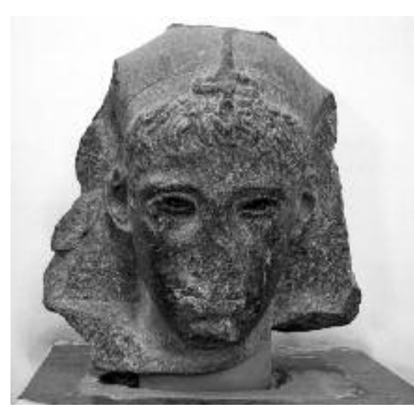
Fig. 1: Head of Ptolemy VI, Greco-Roman Museum of Alexandria.

The duality of Ptolemaic official artistic styles, Greek for Alexandria and the other Greek cities in Egypt, namely Naucratis and Ptolemaïs, and Egyptian for the rest of the country is supposed to have been dominating Ptolemaic arts at least up till year 217 B.C.<sup>14</sup>. In this year the Raphia battle took place and the Egyptian fighters proved to have been strong enough to achieve victory<sup>15</sup>. This seemed to have been a turning point in the Ptolemaic policy towards the Egyptians. Intermarriage between the Greeks and the Egyptians