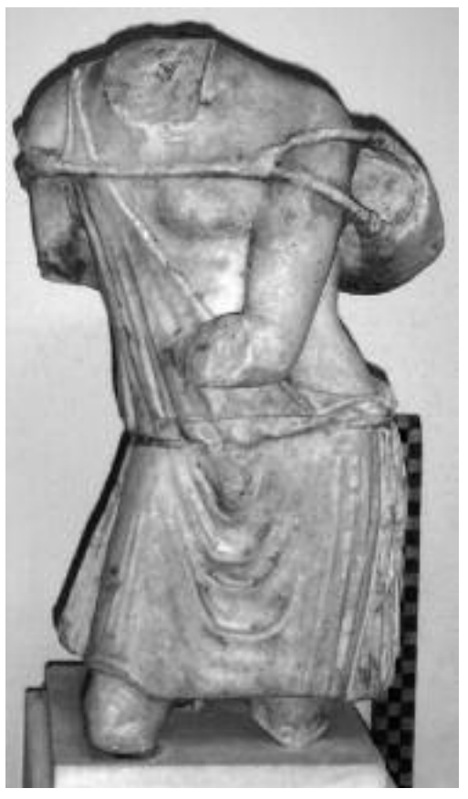
Fig. 5a: Statue of a farmer , Greco-Roman Museum of Alexandria.