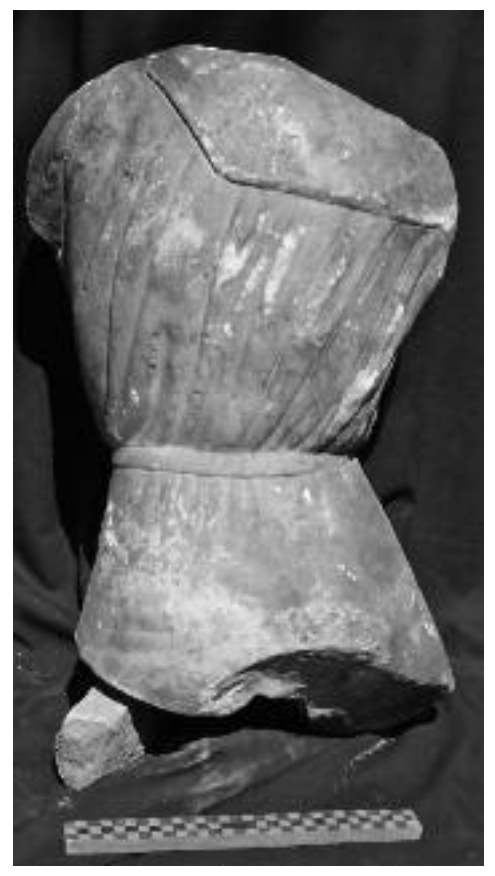
Fig. 4b: Back side of Fig. 4a.

ynoi and drink and eat as much as they can<sup>43</sup>. In the light of the previously mentioned literary texts, the Alexandrian origin of such a statue becomes unquestionable.