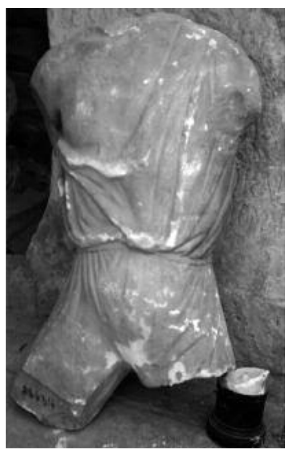
Fig. 4a: Statue of a farmer, Greco-Roman Museum of Alexandria.