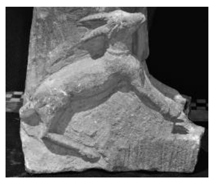
Fig. 6c: Goat at the right side of Fig. 6a.

us with the Egyptian striding figures of dynastic times. This Egyptianizing attire is emphasized by the high protruding ears, the plain linear eyebrows, almond eyes and the obscure facial features without any definite expression. Another unique feature is the presence of a short support at the back of the head (Fig. 6b) which seems to be a reminiscent of the Egyptian conventional back-pillar. However, Egyptian features are mingled with Greek ones; the man wears, not the exomis , but a long sleeved tunic and short necked boots. He carries in his left hand