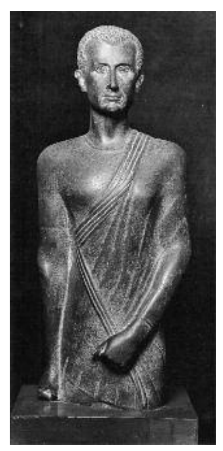
Fig. 3: Statue of Hor son of Hor , Cairo Egyptian Museum.

One last example is very important in this concern, the basalt statue of Hor son of Hor, priest of Thoth during the late Ptolemaic Period (Fig. 3)<sup>27</sup>. It is one of a series of male statuary type characterized by the fringed mantle which is usually worn over a sleeved tunic<sup>28</sup>. The statue is in the Egyptian conventional striding posture with the right hand sticking to the body and the other bent at the elbow and turned forward holding something in its clenched fists. The facial features seem to express the true features of the subject. The curved lines bordering the area between the nostrils, the mouth and the chin together with the receding curved hair boarders over the forehead express the serious and pensive moods which are characteristics of the veristic Alexandrian style. Inscriptions on the back pillar indicate Hor's priestly office<sup>29</sup>. The importance of this statue lies in its provenance at Kom El-Dikka in Alexandria.