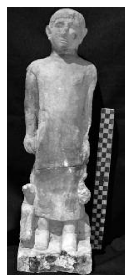
Fig. 6a: Statue of a shepherd , Port Saïd Museum.