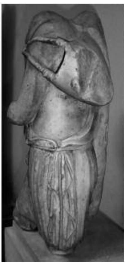
Fig. 5b: Left back side of Fig. 5a.

back (Fig. 4b) seems to have been a pad for a heavy load that the man was carrying. Of the same type of walking farmers usually carrying a load on their backs there is another example (Figs. 5a)<sup>46</sup>; the statue wears the same exomis and carries a basket which is suspended with a thick rope across the chest (Fig. 5b). The movement is accentuated by the leaning of the body to the right, the open legs, and the rigid right knee. The muscled chest with protruding breasts is the same as Fig. 4 and is a naturalistic expression of hard labour. The publisher dates both statues, according to the style of drapery, to the late Hellenistic Period. In the absence of parallels, these two statues were compared to some similar representations in a statue of Odysseos from the Antikythera shipwreck<sup>47</sup> and the most interesting Triptole-